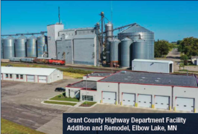
Grant County Highway Department Facility Addition and Remodel, Elbow Lake, MN